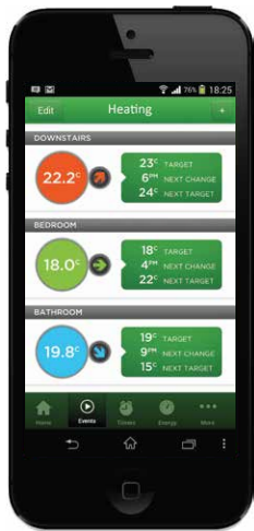
LightwaveRF App showing TRVs controlling separate areas.