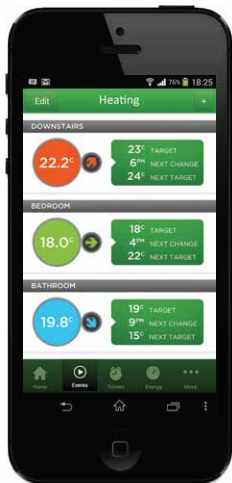
LightwaveRF App showing heating zones.