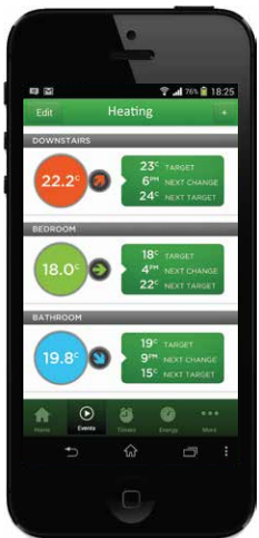
LightwaveRF App showing heating zones.