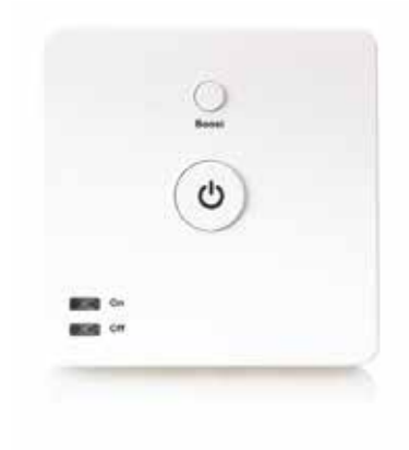
LW920 Boiler Switch