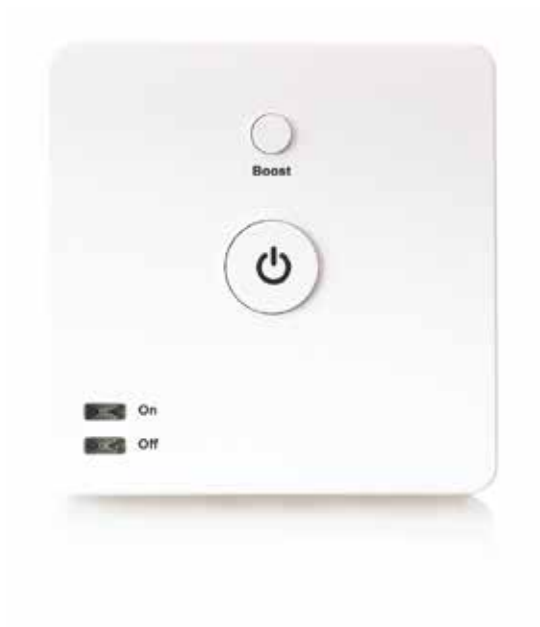
LW934 Electric Switch