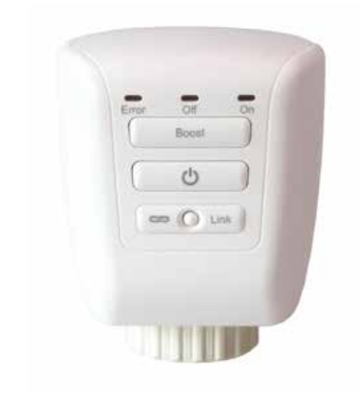
LW922 Radiator Valve