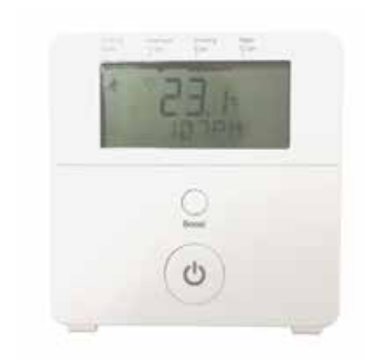
LW921 Home Thermostat