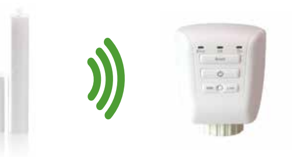
Required: Magnetic Trigger, Radiator Valve

LightwaveRF has the solution to this problem: a LightwaveRF Magnetic Trigger can be attached to a window or door frame using a simple adhesive strip. When the window is open, it will automatically instruct a LightwaveRF radiator valve situated in the room to turn down the radiator temperature. It will then automatically and restore it to temperature on closing. This prevents the heating system working overtime to heat a space that is open to the cold outdoors.