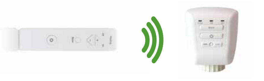
Required: Heating Remote, Radiator Valve

LightwaveRF TRVs can be installed by hand without special tools or plumbing. They turn off the radiator and allow you to be comfortable without having to affect the rest of the house heating. Adding the Lightwave Link will allow you to control the TRV via the LightwaveRF App on a smartphone or tablet.