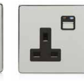
Required: Lightwave Link, Electric Switch