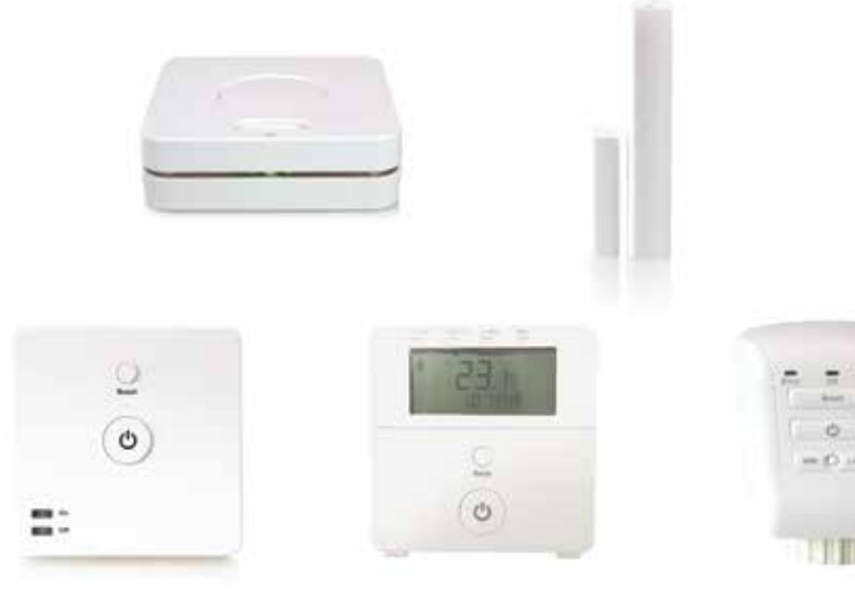
Required: Any heating products

The Magnetic Trigger prevents excessive heat being lost when windows are left open.