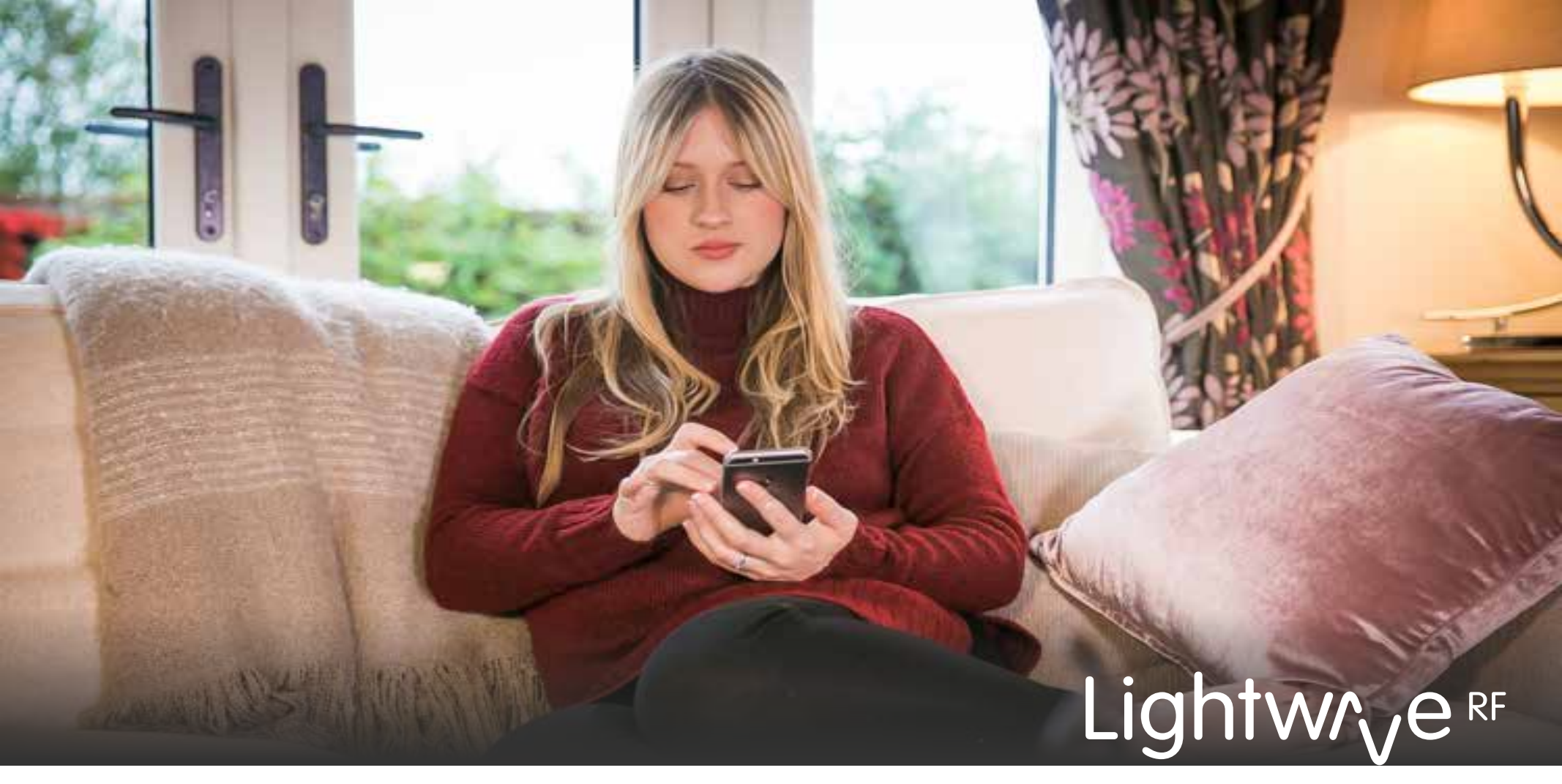
10 things I can do with LightwaveRF heating